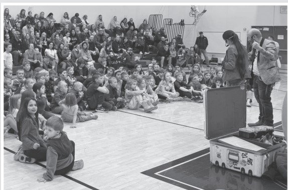
Pictured above: Students and their families enjoy the magic show performance on Family Night.

Mosinee Elementary School hosted a pirate-themed Family Night in April. Students and their families were able to choose from a variety of activities including a delicious meal, face painting, a book fair, an art show, a basket raffle, and a mystical magic show. The elementary staff is grateful for the many generous donations that helped make Family Night a success!